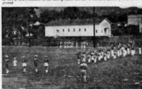
BEND JUNIOR BEAN CORPS passed in review with several hundred spectators in the grandstand as Eagles marched at Folsy field Friday night.