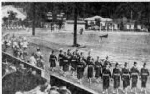
UNIDENTIFIED UNIT passed in review before the Folsy field grounds Friday night in competition among drill teams and drum corps of Eagles.