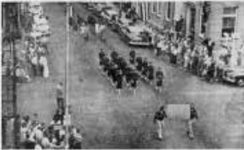
SEVERAL HUNDRED citizens watched Eagles parade in downtown Roseburg Saturday. Women's drill team from Albany in foreground, above, was judged best in the show.