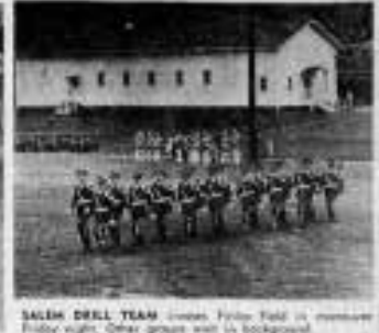
SALEM DRILL TEAM marches Folsy field in measure Friday night. Other groups wait in background.