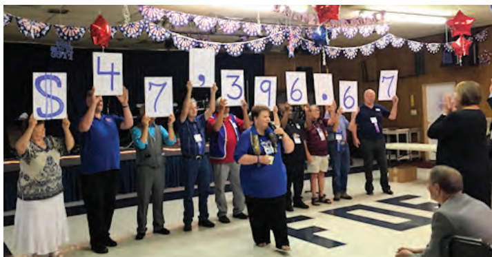
Anthony's amount at State Convention...