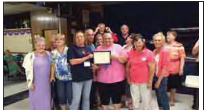
Prineville Aerie - PFO Award $600,000+